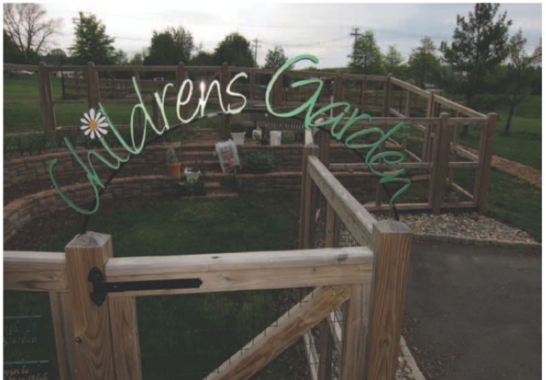
The Children's Museum was my first welding project. It was great. I had a lot of fun doing it and I'm happy with how it turned out.